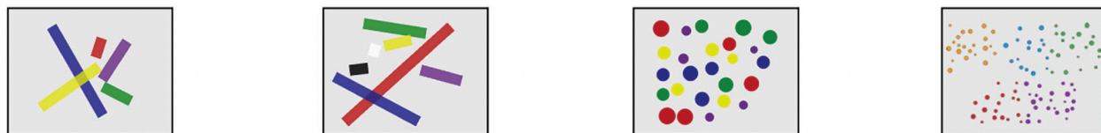
Figure 2: Sample stimuli from Odic et al. (2024). From left to right: Five lines of variable length; Seven lines of variable length; Dots of variable size; Collections of variable number. In each case, people find it easiest to identify the largest and smallest items/collections in each array.

setting the scale. So, whether there were five lines, seven lines, nine lines, or eleven lines, subjects should be just as accurate and fast at identifying the longest and shortest lines. By contrast, if the ordinal position of each line were determined by a series of pairwise comparisons, it should be harder and take longer to identify the longest and shortest lines as group size increases. Both predictions were confirmed. Moreover, the findings persisted in follow-up studies when the researchers substituted area or number for length. Subjects were always fastest and most accurate at identifying the endpoints; and their ability to do so was unaffected by group size. And although one might initially worry that performance was a byproduct of how the task was phrased (the longest and shortest lines were explicitly named), the findings held up when subjects were asked to find the third line above/below the middle, instead of the longest/shortest.